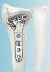
ANTHEM® Volar Plate

The balance of a low profile design and a purposeful absence of central screw holes increases mechanical strength compared to traditional plating.*