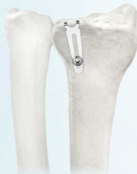
Lunate Facet Hook Plate